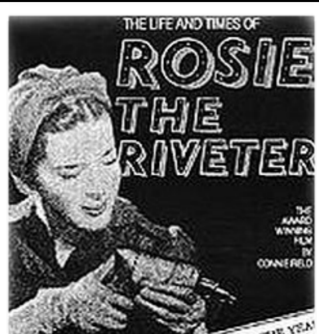
Women in Film