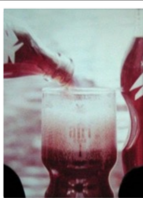
Advertising through History